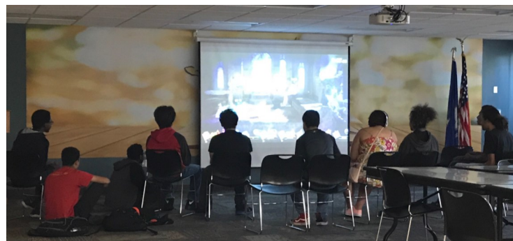
Teens playing video games during a recent gaming session. Teen Gaming happens twice a month.

Call 860-224-3155 ext. 130 to schedule a free half hour session with one of our professional tutors. All New Britain students in grades 6-12 are welcome. Walk-ins welcome. Funded by the American Savings Foundation.